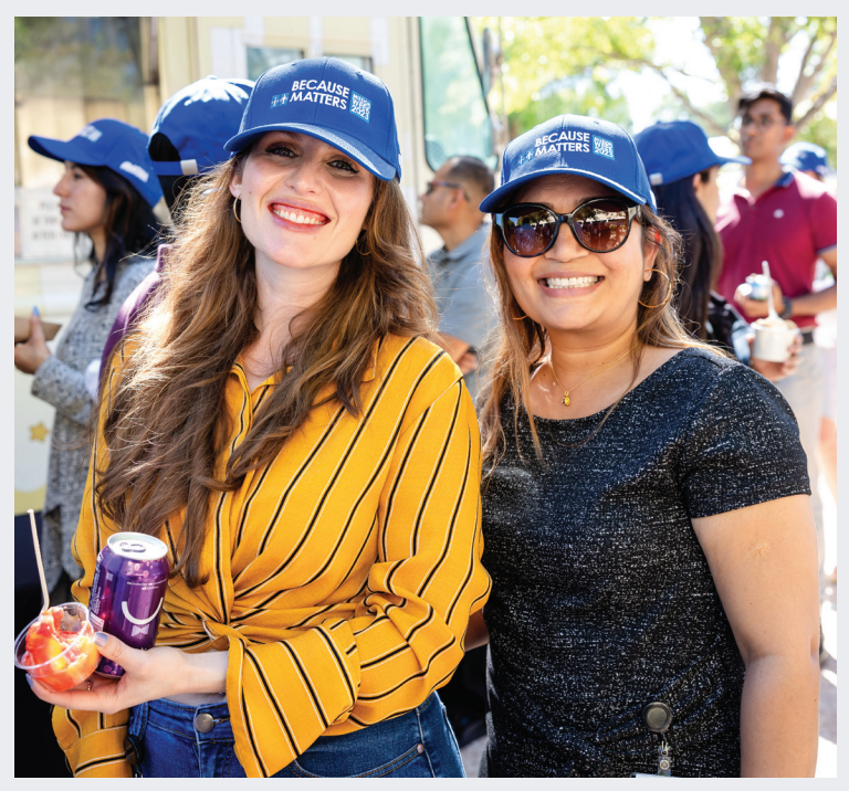
Employees celebrated Mission Week at Amgen's world headquarters in Thousand Oaks, CA (above), and in Singapore (below).

More than 10,000 employees around the world either attended live or tuned in virtually to a patient panel, with nearly 95% saying afterward that the events of the week gave them motivation to better serve patients and an improved understanding of the pressing issues patients face.